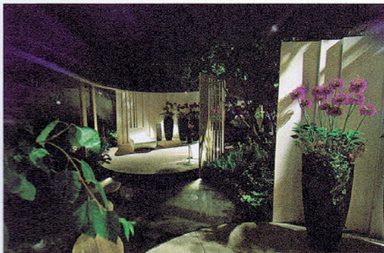
Ode to the summer